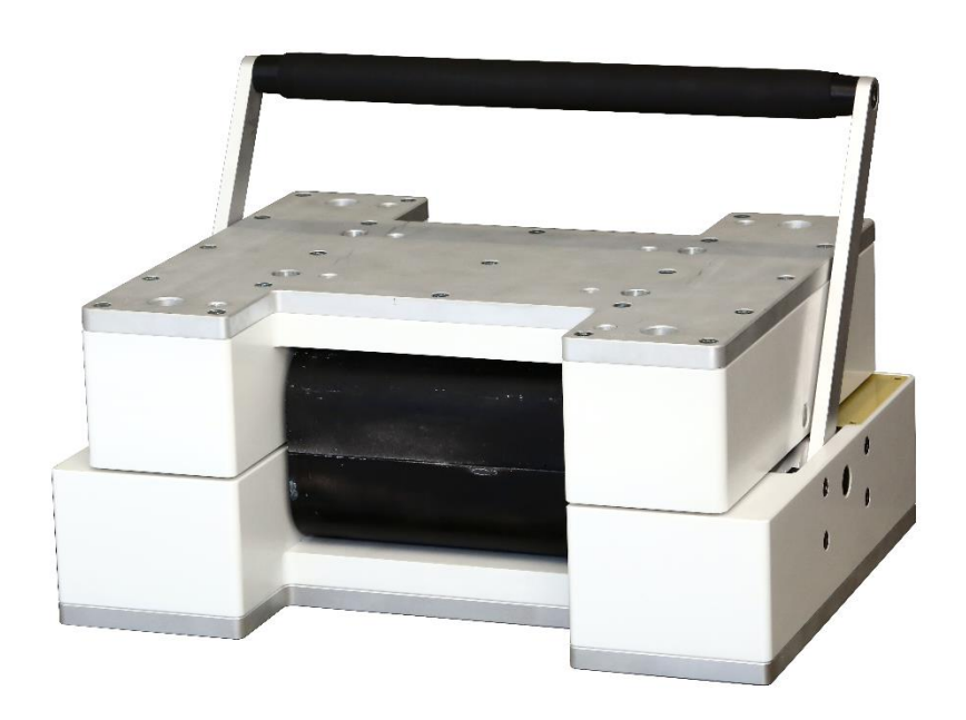
MJC 210 – Small table top Single Sheet Tester for the AC hysteresis measurements