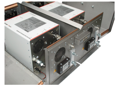
Flexible HV connection

High voltage part of the following standards: