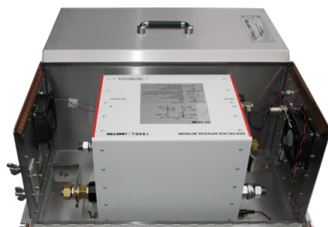
Side view with HV-AN 500, full screening using screened room door technology