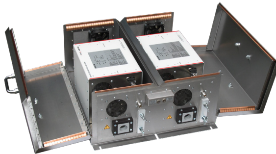
Both sides fully open

The shielded metal enclosure (SME) is designed to contain two High Voltage Artificial Networks, HV-AN 500 according to ISO/DTS 7637-4 and the HV part of CISPR 12 (draft), CISPR 25, ECE No. 10 R05/06 and ISO 11452-1. It is applicable to all electrical vehicles, i.e., battery, hybrid or plugin electric vehicle. The design of the SME HV-AN 500 allows easy handling when connecting the coaxial HV+ and HV- lines to the HV-AN. The cable shield is contacted through two massive terminals to enable a good RF ground contact through the massive terminals. The inner conductor is strain-relieved by the cable gland and led to the connections of the HV-AN. The SME HV-AN 500 allows the two individual HV AN to be directly connected to the ground plane and allows access to each HV AN. In addition to the box, the scope of delivery of the SME HV-AN 500 includes two RF cables and four connection brackets.